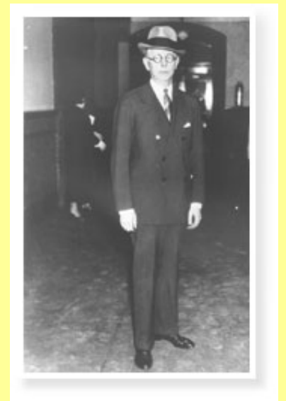
Livermore was subject to deep black depressions all his adult life, during success or failure. This photo was taken on November 26, 1940, two days before "The Great Bear" of Wall Street took his own life.