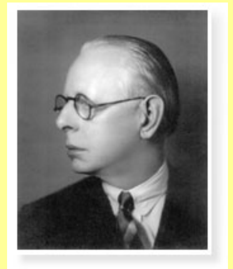
Jesse Livermore was a handsome and powerful man who cherished his secrecy and his private life. He moved in silence and mystery and was like catnip to women.