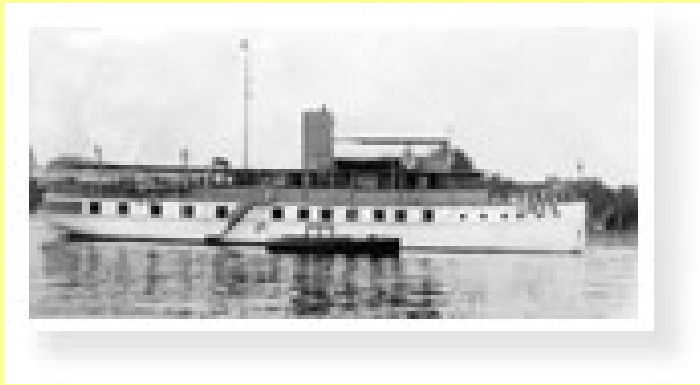
The original Anita Venetian with a 40-foot launch tied along side. Livermore loved yachting. In all there were 3 Anita Venetians —the last one was 300-foot long.