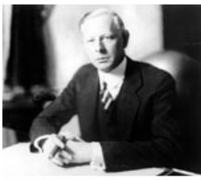
Jesse Livermore, the legendary "Boy Plunger" and "Great Bear of Wall Street" in his office in 1929 just after the "Crash"—when he went short the market and made over 100 million dollars. His powers were at their highest. His life slid downhill from here—ten years later he would kill himself.