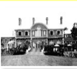
Livermore's mansion "Evermore" at King's Point Long Island. The dining room table sat 46 for dinner. There was a barbershop in the basement with a live-in barber. His 300-foot yacht was anchored in the back yard. The mansion was the scene of many grand parties—finally auctioned off—June 27th, 1933.