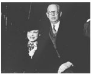
Jesse Livermore "The Boy Plunger" of Wall Street and his wife of twenty months set sail to Europe on the S.S. Rex after his 1934 bankruptcy. Before boarding Livermore said, "I hope to relieve my mind of some of my troubles."