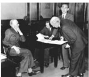
Jesse Livermore sits before the bankruptcy referee on May 15, 1934. Livermore always paid his bankruptcy creditors back when he got back on his feet, even though he was not legally responsible.