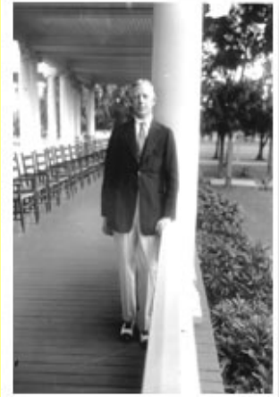
Jesse Livermore stands on the porch of the Breakers Hotel in Palm Beach where he took a large apartment every winter. He traveled to the Breakers in his private railway car and had his yacht sent down to Palm Beach ahead of his arrival.